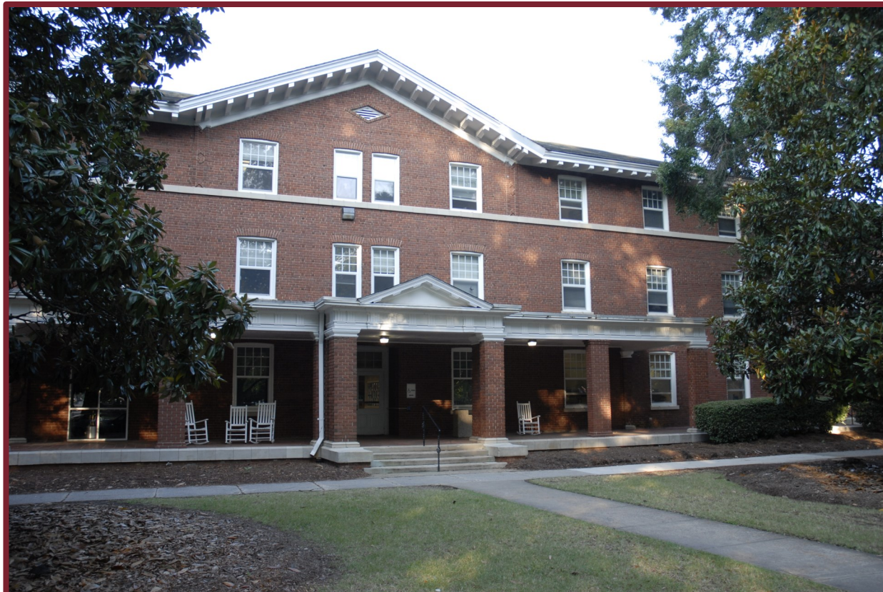
Paneroft Hall—Home of the Social Work Department