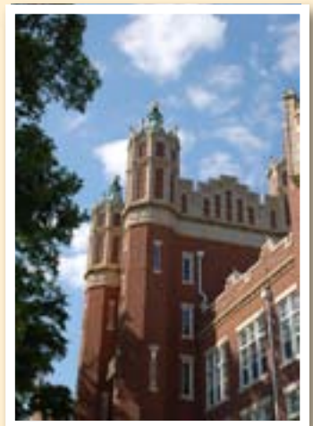
The Withers/W.T.S. Building celebrated its 100th anniversary.