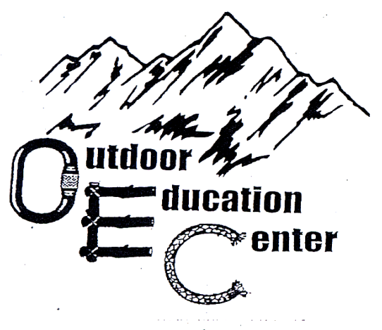
at WINTHROP UNIVERSITY

Department of Physical Education, Sport & Human Performance