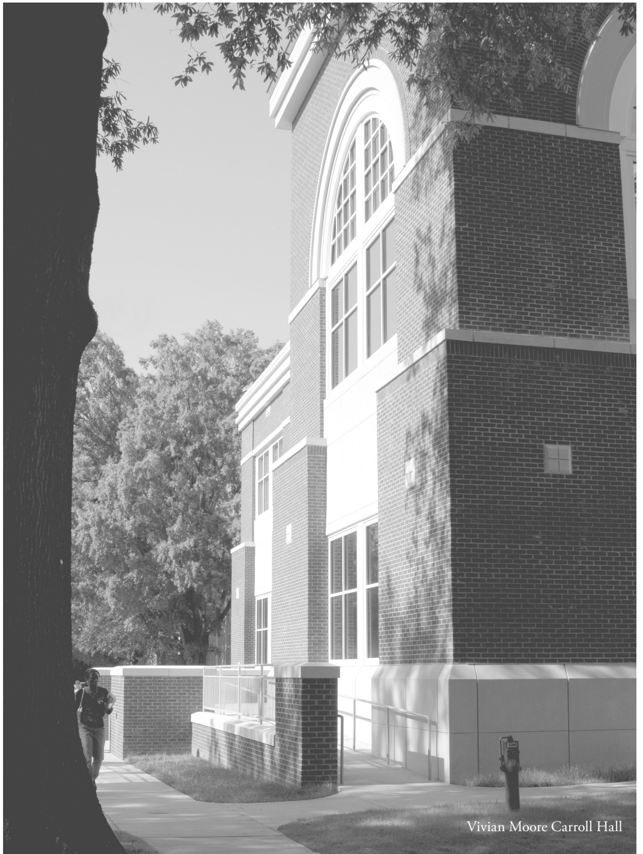
Vivian Moore Carroll Hall