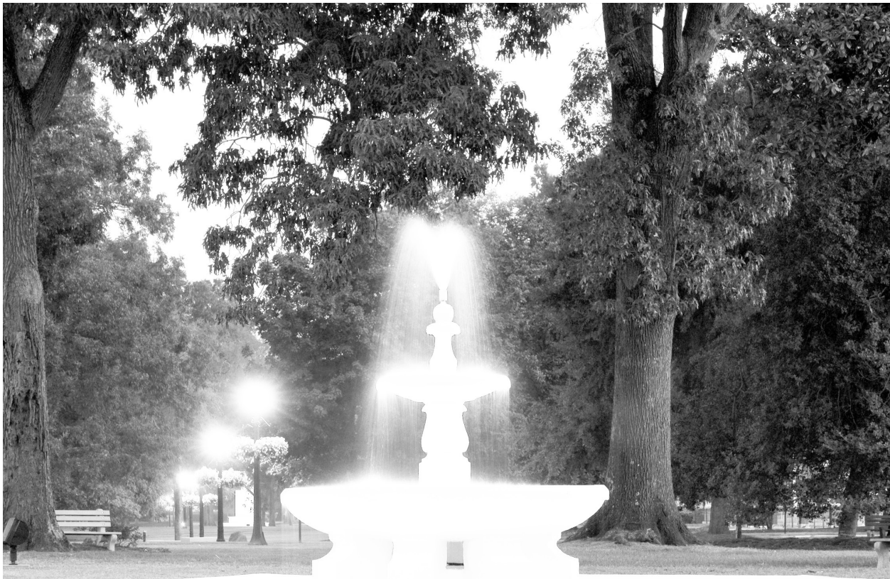
The fountain in front of Tillman Hall has served as a popular Winthrop symbol since it was constructed in 1912.