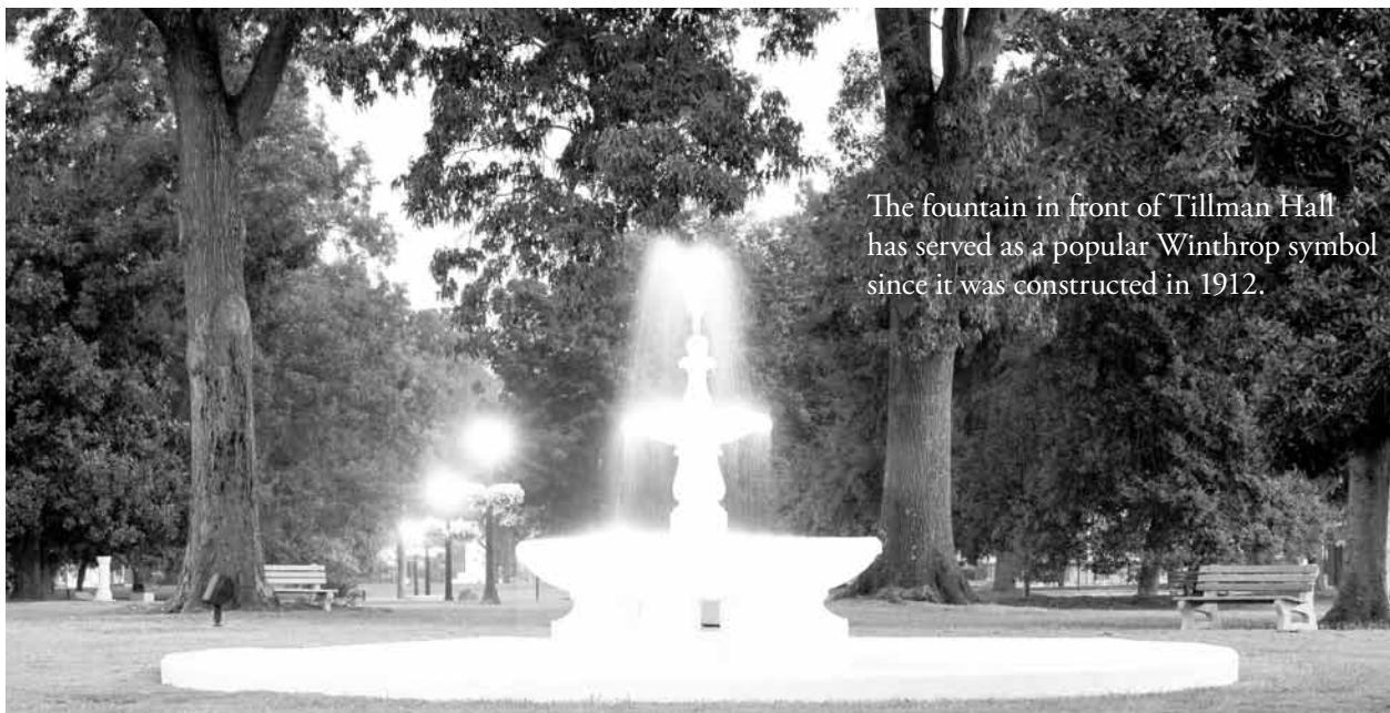
The fountain in front of Tillman Hall has served as a popular Winthrop symbol since it was constructed in 1912.