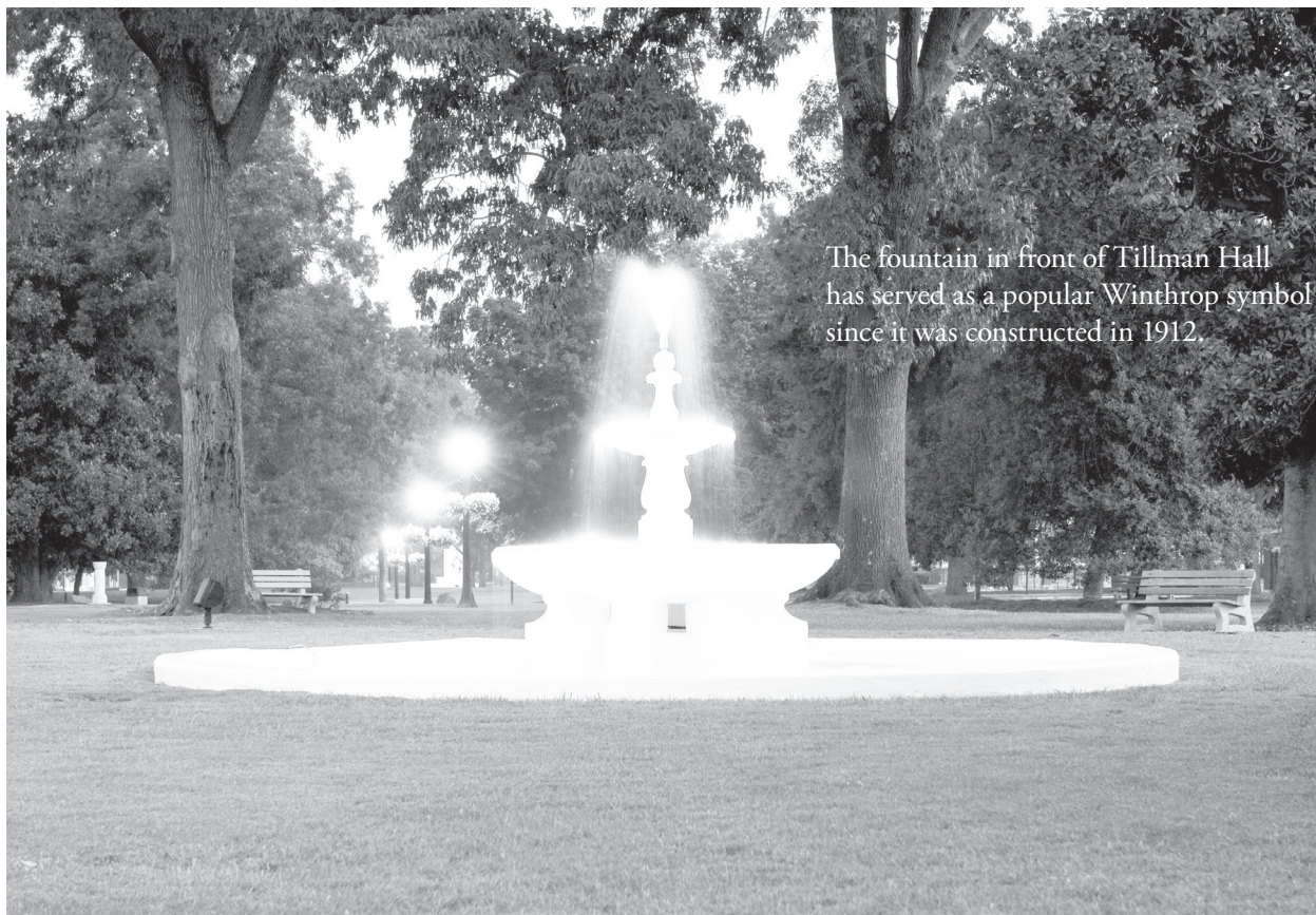
The fountain in front of Tillman Hall has served as a popular Winthrop symbol since it was constructed in 1912.