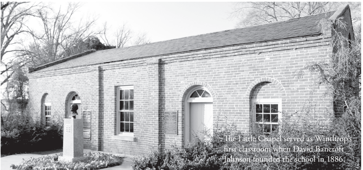
The Little Chapel served as Winthrop's first classroom when David Bancroft Johnson founded the school in 1886.