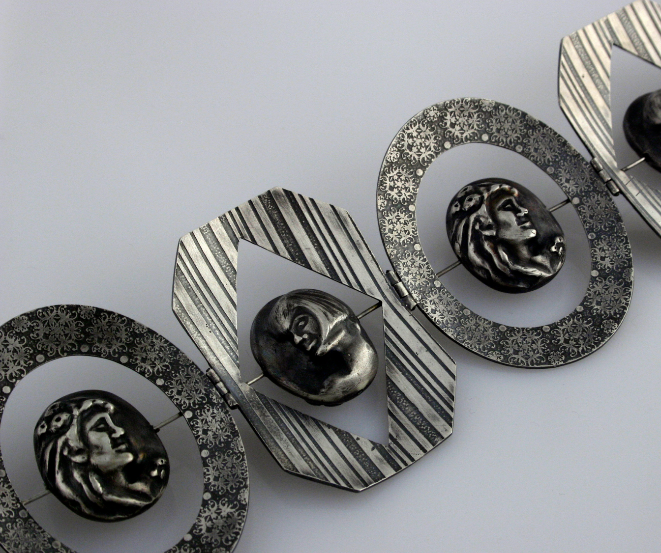
Mekayla Standefer sterling silver and nickel, cast