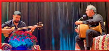
LIVE PERSIAN MUSIC