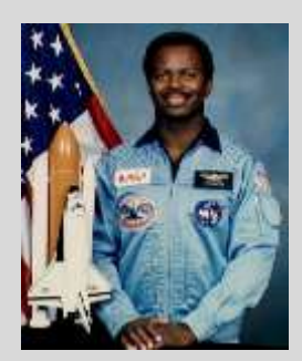
McNair Scholars Program

Winthrop's McNair Scholars Program includes, but is not limited to, a paid summer research experience, faculty mentoring, workshops, GRE and graduate school application preparation, and travel to present research and explore graduate programs.