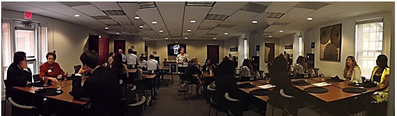
2013 May Graduation Luncheon