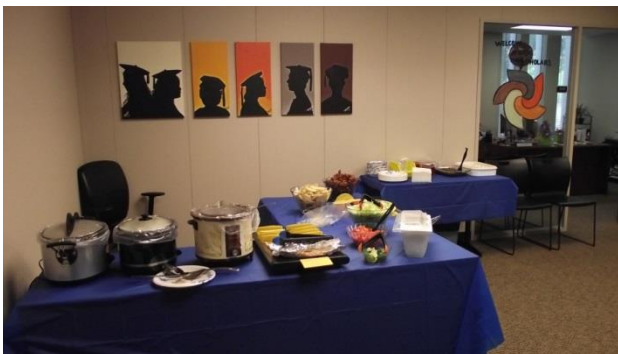
Taco Bar at Taco Thursday