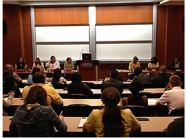
Graduate school advice panel at SC McNair Orientation