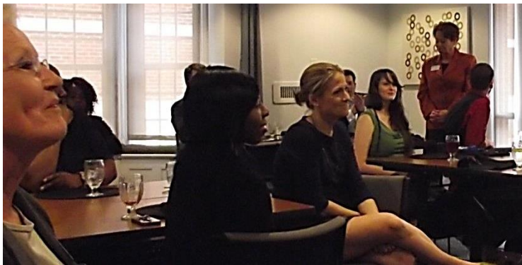
2013 May Graduation Luncheon