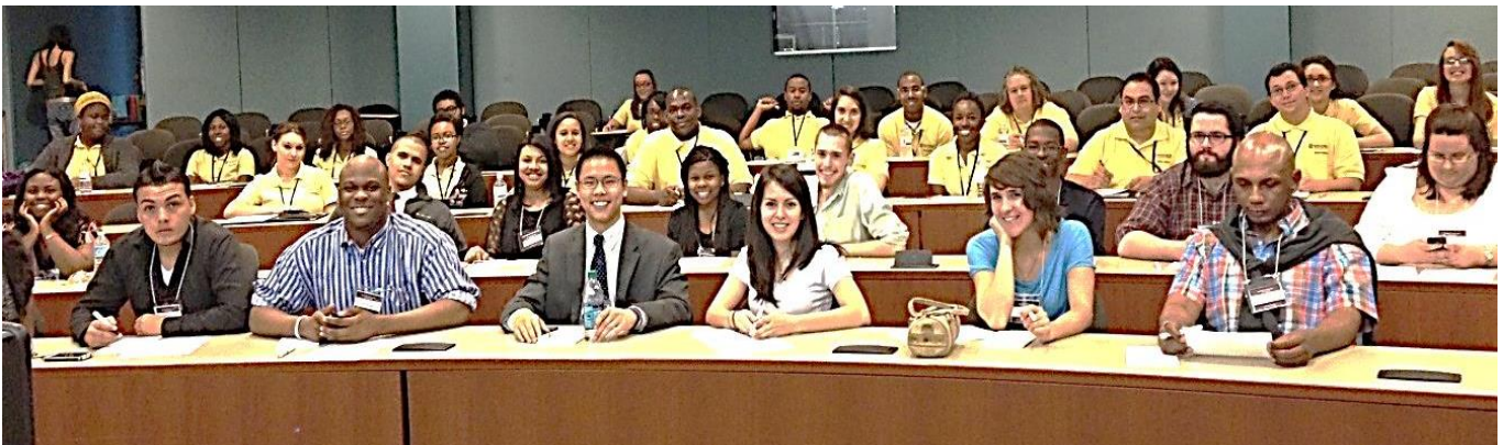
McNair Scholars at the SC McNair Orientation - Winthrop McNair Scholars are seated in back two rows, wearing yellow Winthrop McNair polos.

Winthrop McNair would like to thank the College of Charleston for graciously opening up their doors and hosting this event. Our Scholars had a wonderful time and learned a lot!