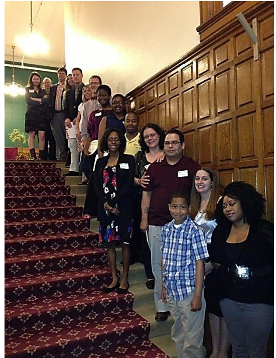
Scholars at Winthrop's Scholar Day on April 30