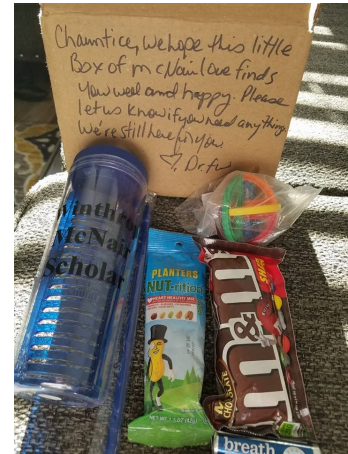
Goodie package contents