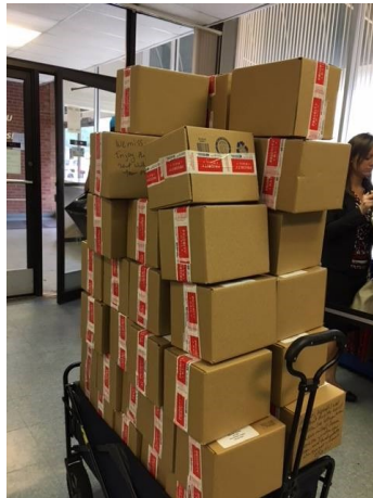
Goodie packages before shipment