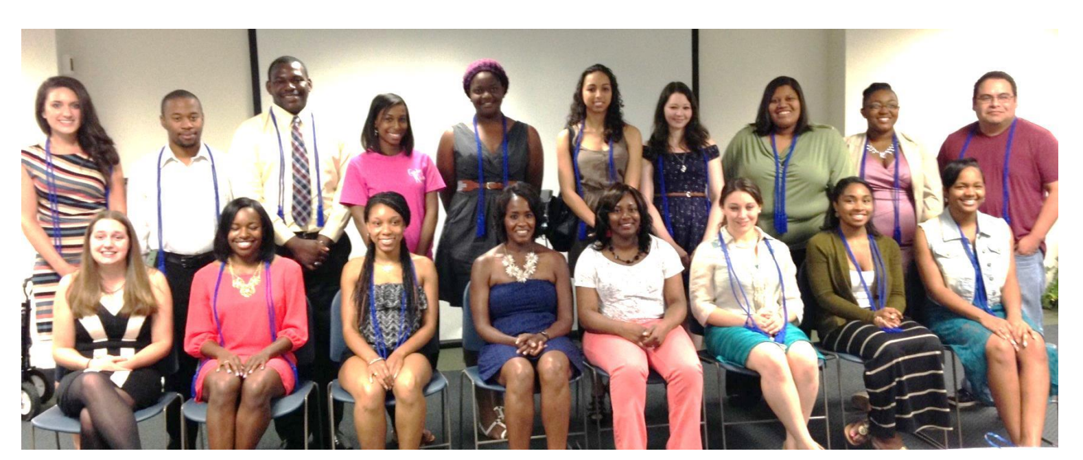
McNair Scholars and Alumni at the 2014 Graduation Celebration Luncheon.