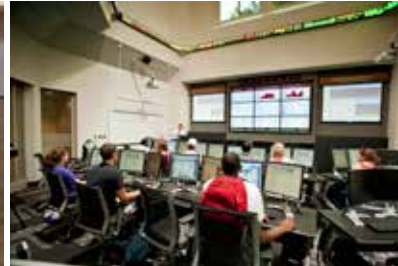
Suzanne Kirsh Community Service Student Lounge