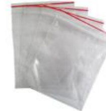
RESEALABLE FOOD STORAGE BAGS