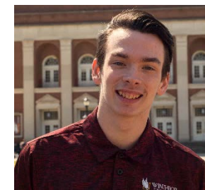
Dale Fox Theatre Education Ladson, SC