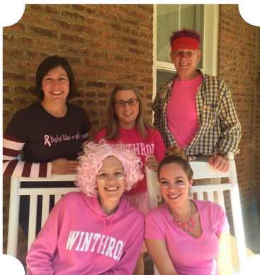
Center for Career and Civic Engagement