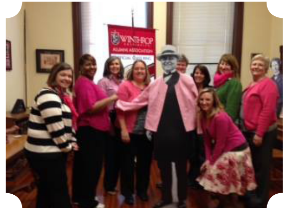
Development and Alumni Relations