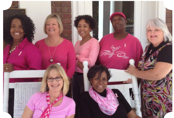
Staff in Joynes Hall: Admissions, Public Events and Facilities Mgmt.