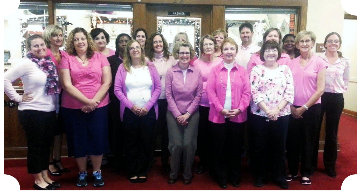
Finance and Business