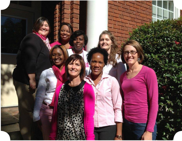
Social Welfare Research and Assessment

October was Breast Cancer Awareness Month. Several staff initiatives helped raise awareness and promote employee health on campus. The mobile mammogram bus came to campus and screened dozens of employees. In addition, on Thursday, Oct. 30, the campus and community involvement committee coordinated a campuswide "PINK-OUT DAY" to raise awareness for breast cancer. Who wore it best?