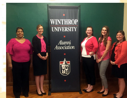
The Office of Alumni Relations and Annual Giving supporting Pink Out Day!