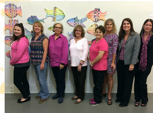
The ladies of the College of Visual and Performing Arts "pinked out".