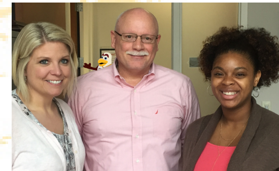
The West Center staff on Pink out Day.