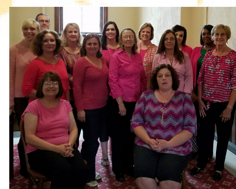
Pink Out Pic for Finance & Business: Controller's Office, Student Financial Services and Accounts Payable.