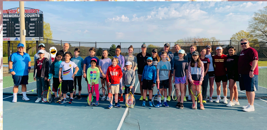
Women's Tennis held a clinic on March 30 for area youth, including many faculty and staff children!