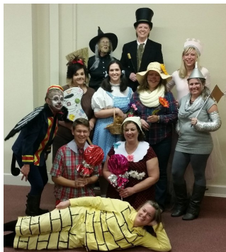
The Cashier's Office