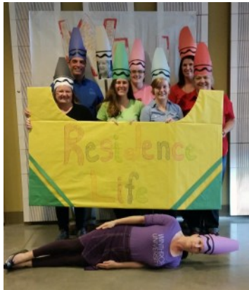
The Residence Life Team