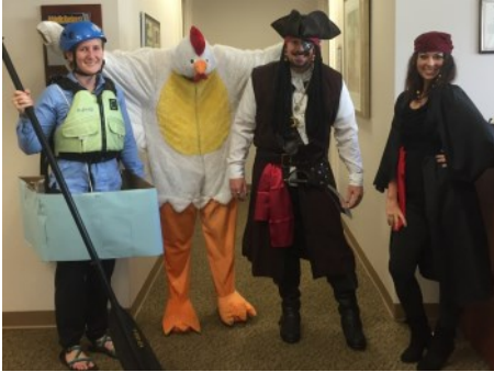
The West Center Team