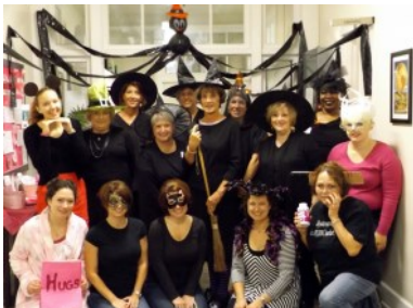
The Health and Counseling Services Team