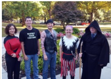
The IT Team