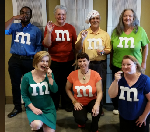
Residence Life team as M&Ms.