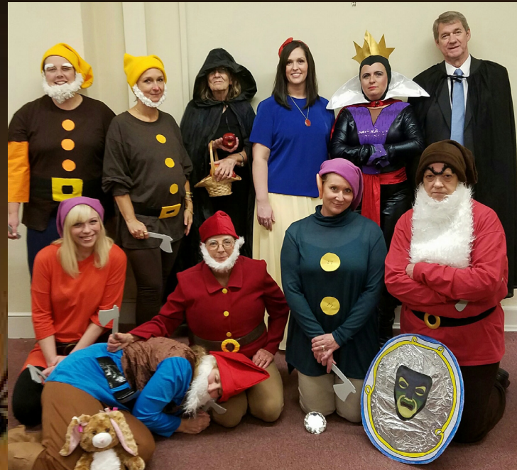
Finance and Business team as Snow White and the Seven Dwarves.