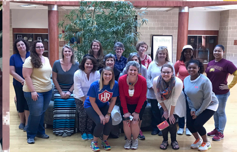
Faculty and Staff members congregate in the West Center lobby before leaving for the "Walktober" stroll around campus. Hosted by the Office of Recreational Services, the twice-weekly walks around campus in October were an effort to meet the American Heart Association's suggestion to get 30 minutes of exercise a day to maintain body weight and lower the risk of obesity.