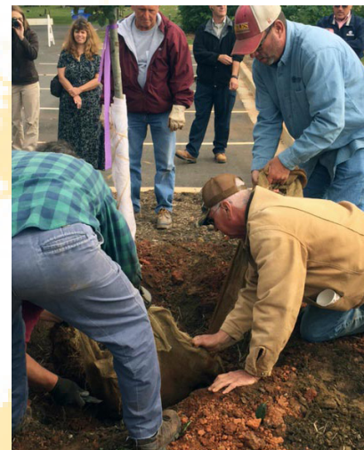
Members of Winthrop Facilities Management team help plant a tree at the Volunteer Tree Planting Day at Laurelwood Cemetary.