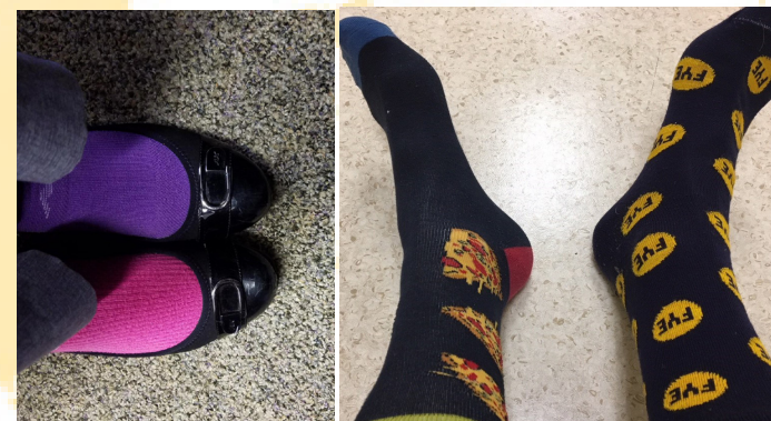
On March 21, staff all across campus wore mismatched socks in recognition of World Down Syndrome Day!