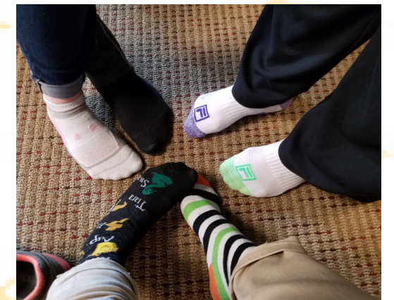
The Residence Life team!