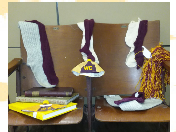
Socks from the Louise Pettus Archives collection.