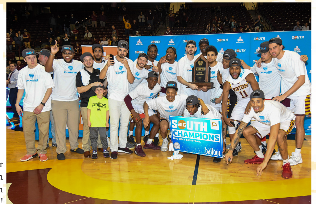
The men's basketball team after their win at the Big South Conference Championship on March 8!