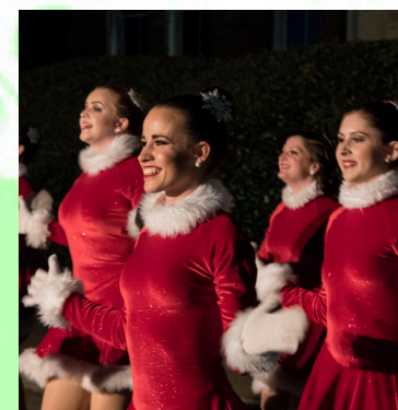
The ChristmasVille Rockettes at the tree lighting on December 1.