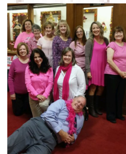
Staff from Student Financial Services, the Cashiers Office, and the Controllers Office.