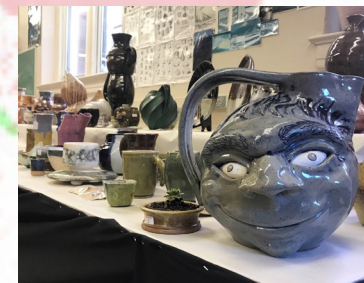
Pieces from the Annual Pottery Sale on December 1.