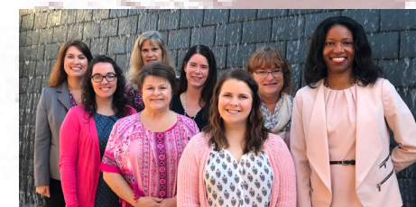
College of Visual and Performing Arts Deans Office.