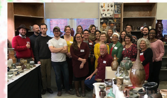
Student artists at the Annual Pottery Sale on December 1.