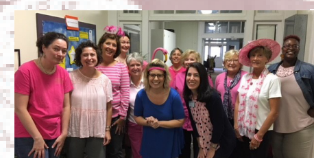
Health and Counseling Services