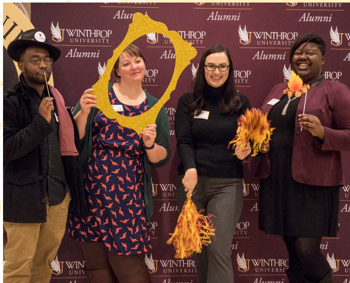
Residence Life staff pose for a picture at the Homecoming Alumni Faculty/Staff Luncheon on November 13.