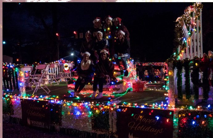
Admissions staff and students on the Winthrop float during Rock Hill's Christmasville parade.