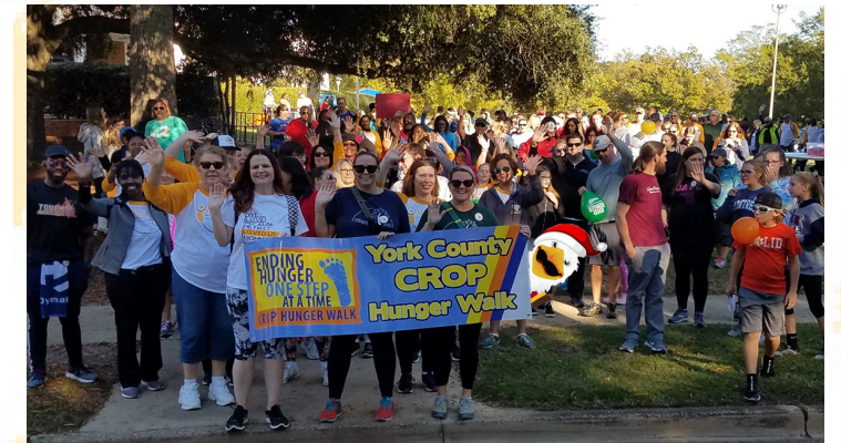
Many Winthrop staff members participated in this year's York County CROP Walk to fight hunger in our community.