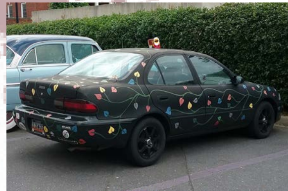
The Mighty Geo 1995-2017