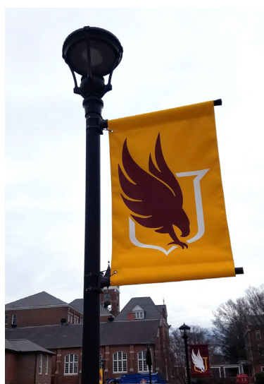
Winthrop's new logo appears across campus.