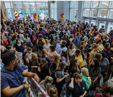
Faculty, staff, and students gathered in the DiGiorgio Campus Center for the unveiling on February 22.