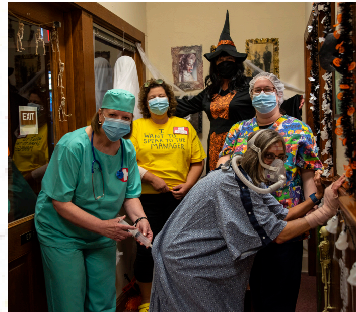
The award for best group costume goes to the Cashiers Office and Student Financial Services!