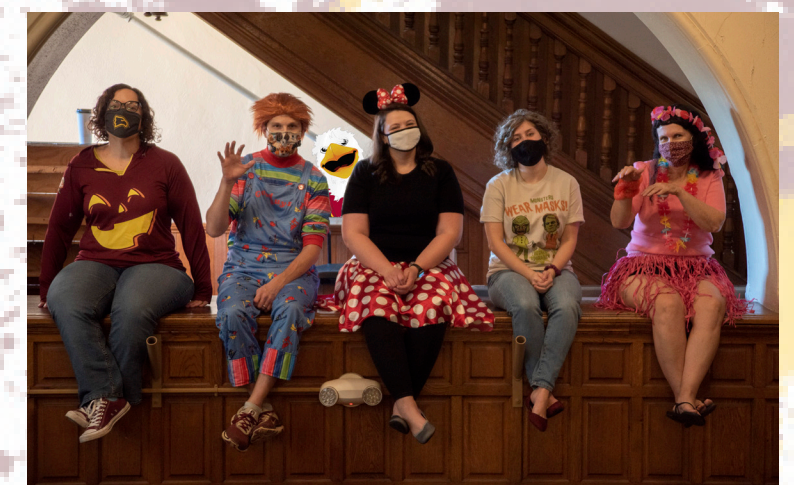
Staff from University Communications & Marketing!