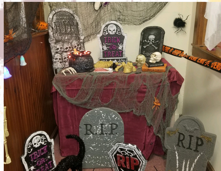
The Cashiers Office went all out on their decorations!