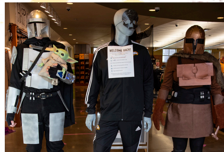
It's hard to tell the staff apart from the mannequins at the Campus Bookstore!