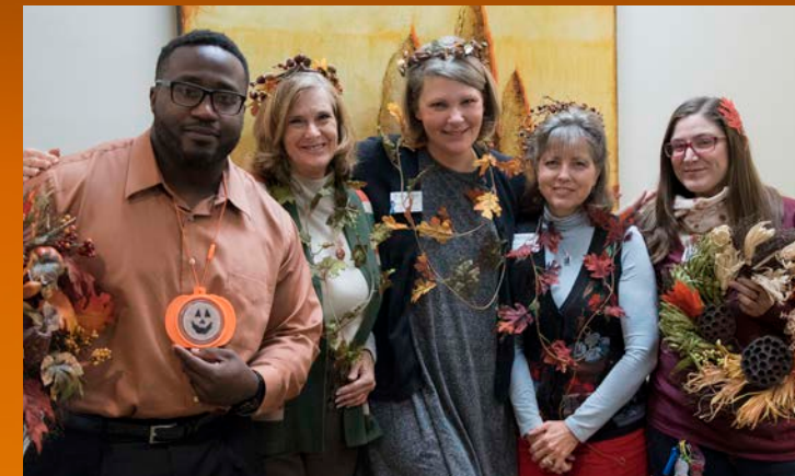
The Dean of Students Office as fall.