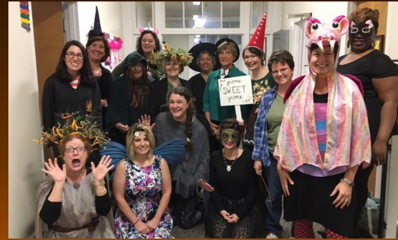
The Health and Counseling Services team as mythical creatures.