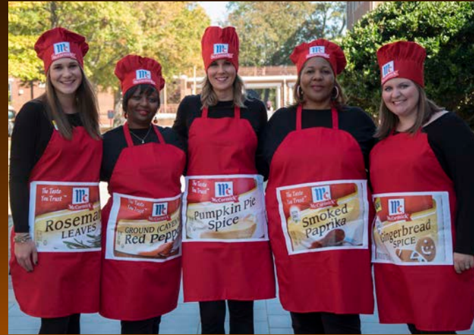
Alumni Relations staff as the "Spice Girls."