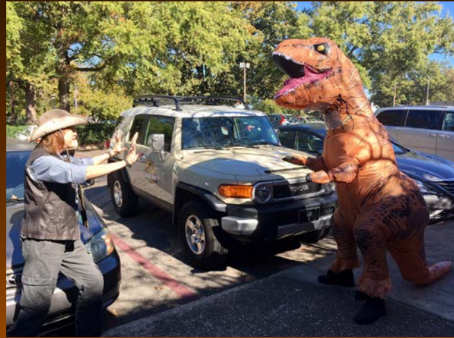
Dacus Library staff as Owen Grady and a T-Rex from "Jurassic World."