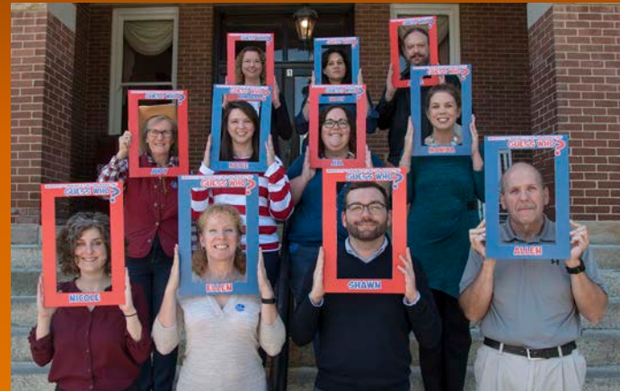
University Communications and Marketing staff as characters from the board game Guess Who?