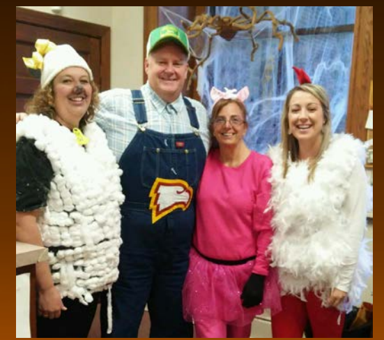
Cashiers and Controller's Office team members as a farmer and farm animals.