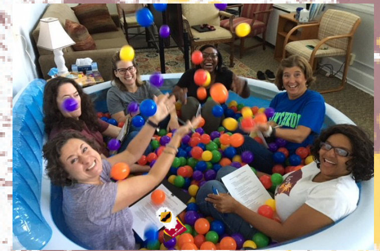
Health and Counseling Services testing out the Chill Out booth planned for this month's Fresh Check Day.