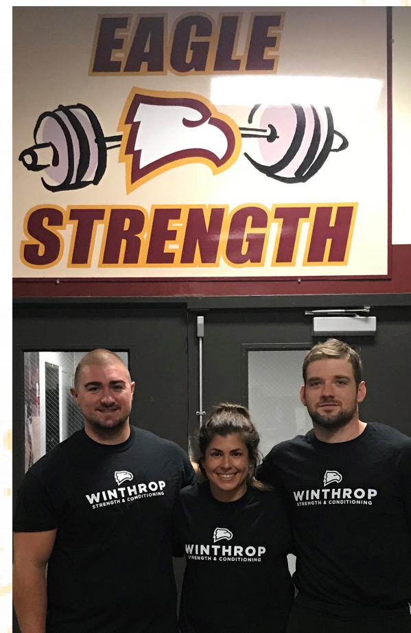
Pictured from left to right: