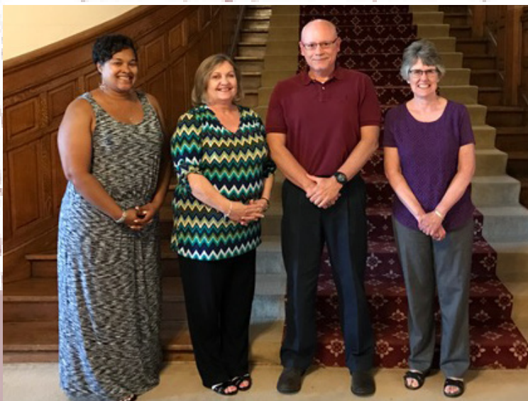
At the June 2017 Staff Conference these five received Certificate of Service award: