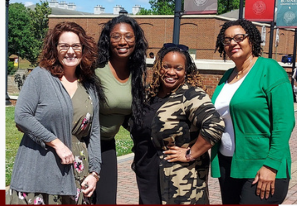
Clockwise from top left: Students and staff from the School Psychology Program; Staff from the Center for Student Wellness; Staff from the Department of Institutional Effectiveness; Staff from the Controller's Office, Student Financial Services, and Cashier's Office