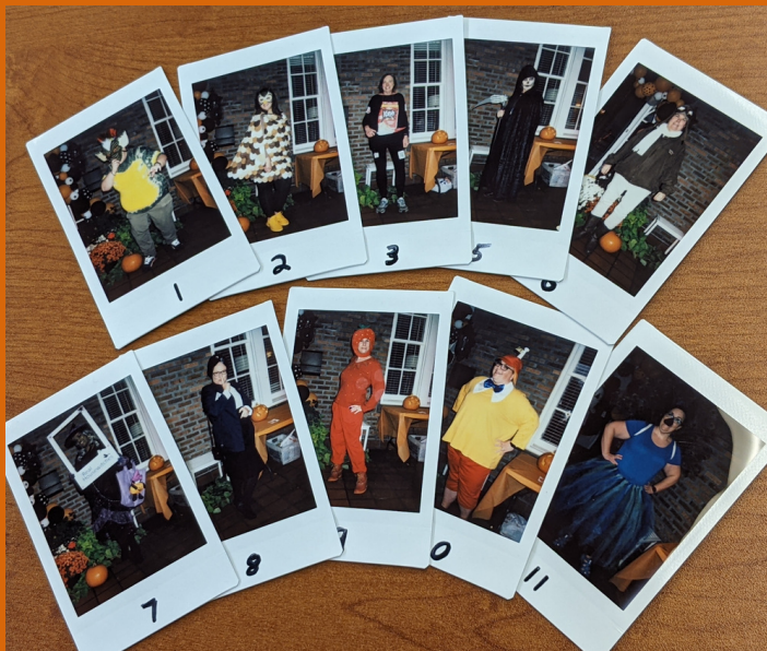
Office of Admissions