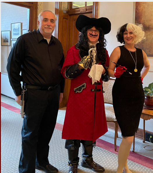
The Provost's Office was feeling a bit villainous