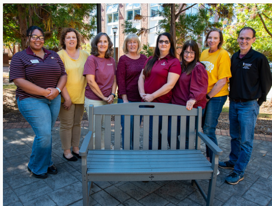
CCIC members show off the new bench in Hardin Garden

We are currently in our second six-month collection period, so be sure to drop off your bags in the donation boxes in Cashiers, Dacus lobby, or Facilities lobby. From there, volunteers will weigh the bags and deliver them to a local retailer in exchange for another bench!