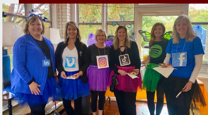
Health Services was feeling like social butterflies