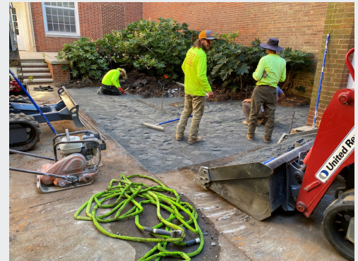
The Music Courtyard is getting an enlarged paver area to make the space more functional for small group performances. This is a shared Eagle Scout, Facilities, and Music department project.