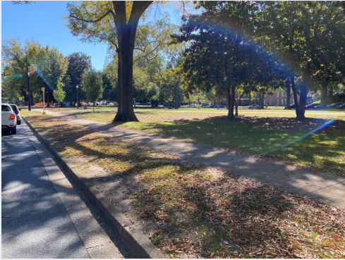
Oakland Fence removal is wrapping up.