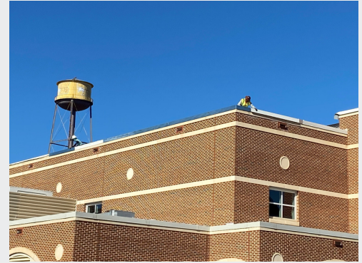
The West Center roof is progressing well.