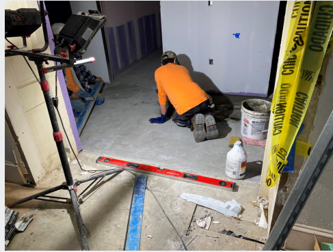
The McLaurin bathrooms (by the elevators) are getting level floors in preparation for tile, and flood repair will start shortly.